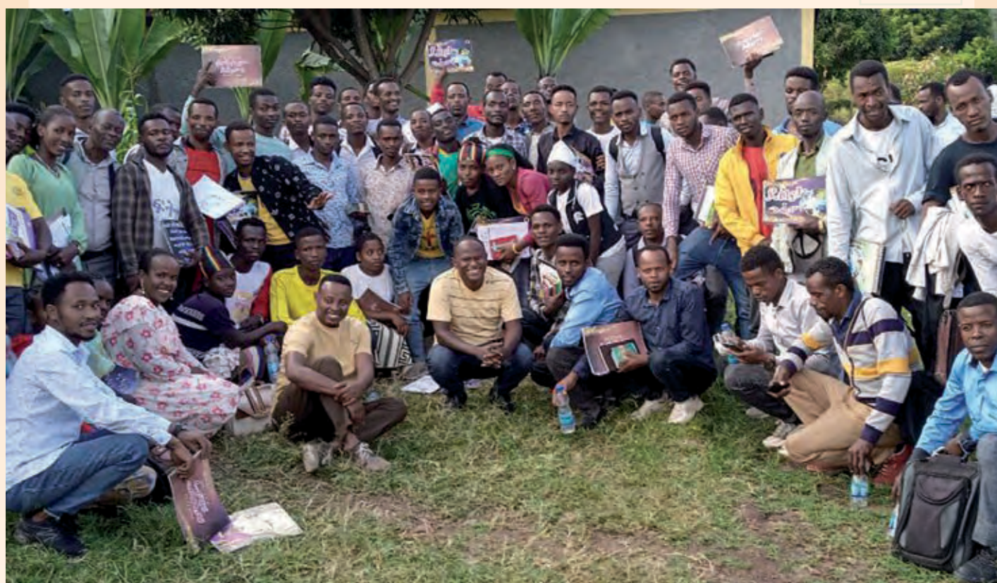
Above - CEF Volunteers in Ethiopia who have just received training on conducting Christmas Party Clubs